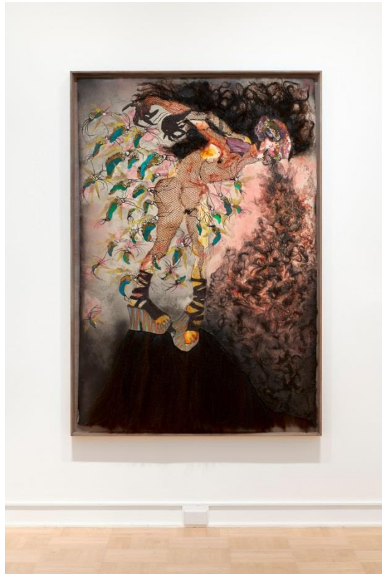
PLURAL POSSIBILITIES & THE FEMALE BODY | HENRY ART GALLERY