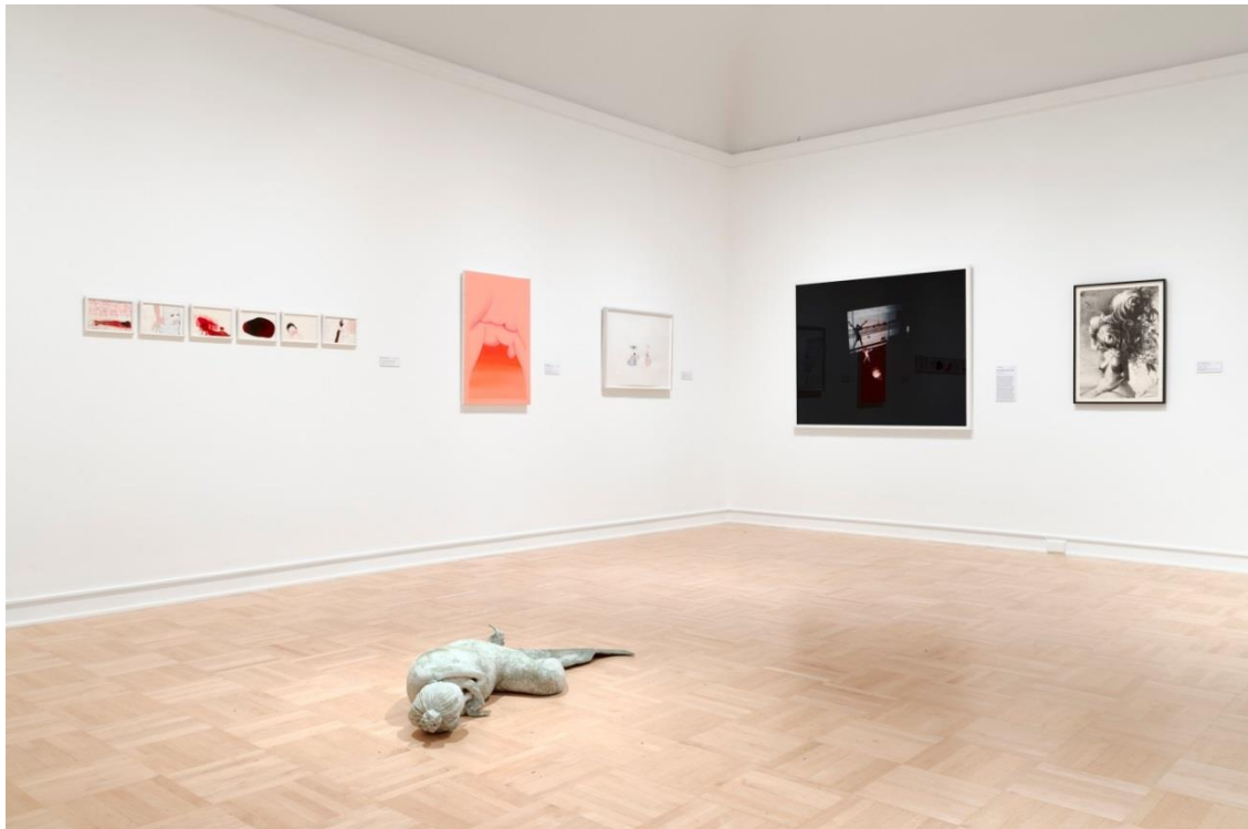
Gallery 6, from West to South Wall: Installation views of Plural Possibilities & the Female Body, 2021, Henry Art Gallery, University of Washington, Seattle.