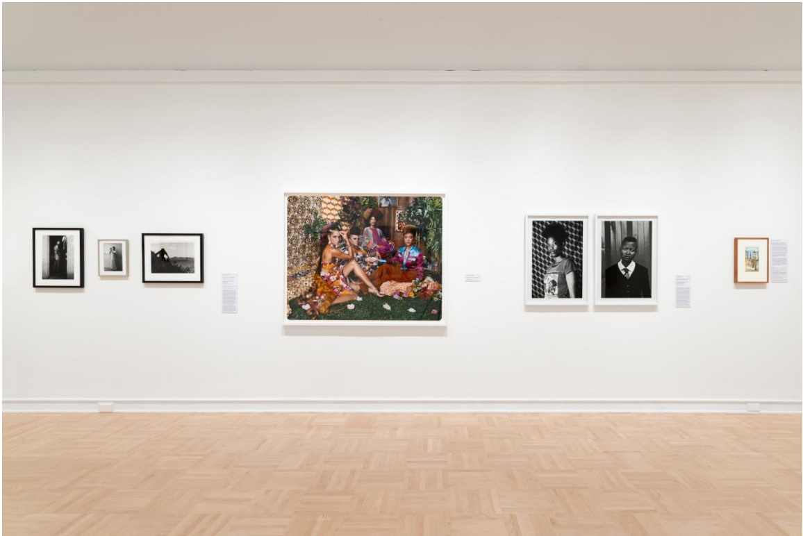
Gallery 5, from West to South Wall: Installation views of Plural Possibilities & the Female Body, 2021, Henry Art Gallery, University of Washington, Seattle.