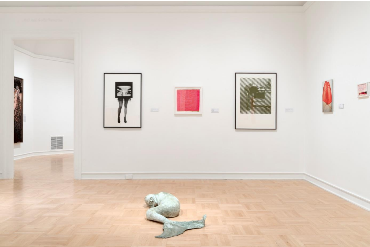
PLURAL POSSIBILITIES & THE FEMALE BODY | HENRY ART GALLERY